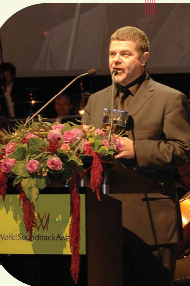
Oscar winner Gustavo Santaolalla received the Public Choice Award at the World Soundtrack Awards, for his music for Brokeback Mountain .