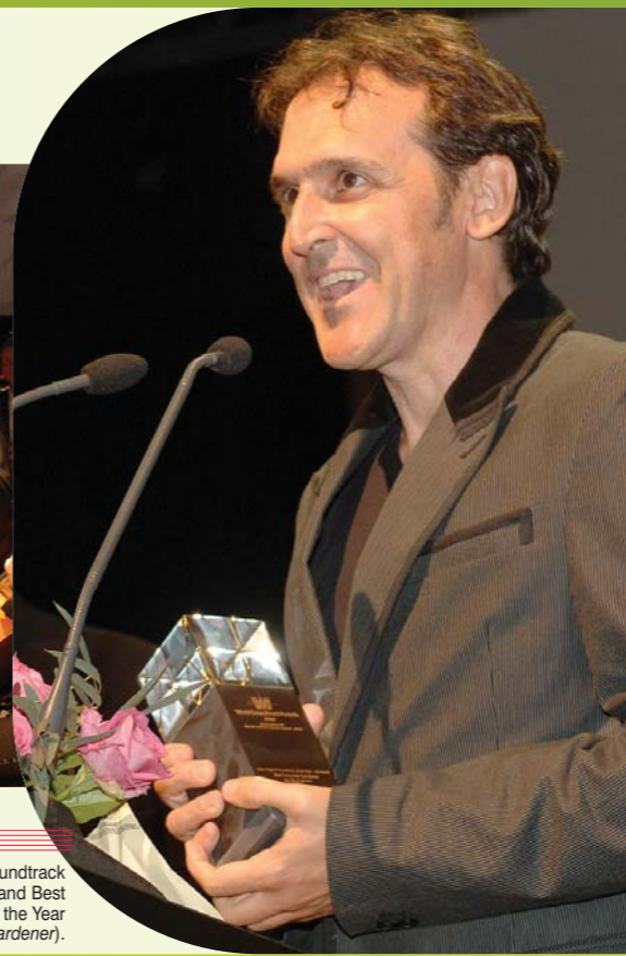
Alberto Iglesias, Soundtrack Composer of the Year and Best Original Soundtrack of the Year ( The Constant Gardener ).