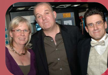
Craig Armstrong Film Works, live at the Flemish Opera House in Ghent.