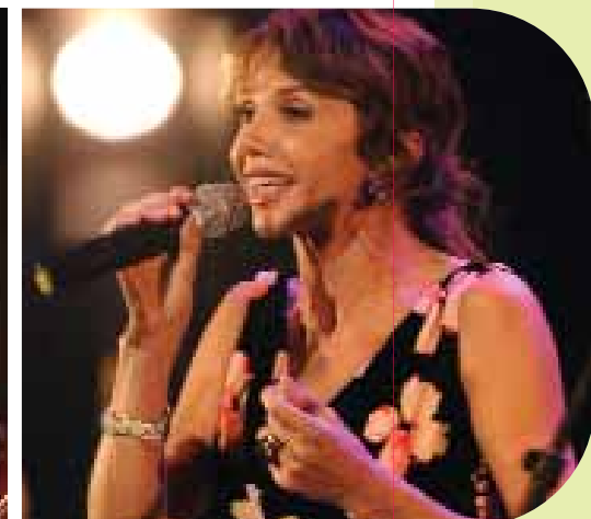
Victoria Abril, singing bossa nova in Arts Centre Vooruit