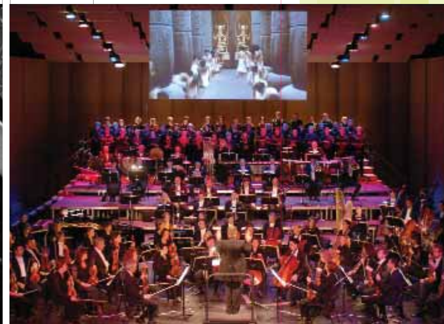
Polish Composers in concert featuring the National Orchestra of Belgium