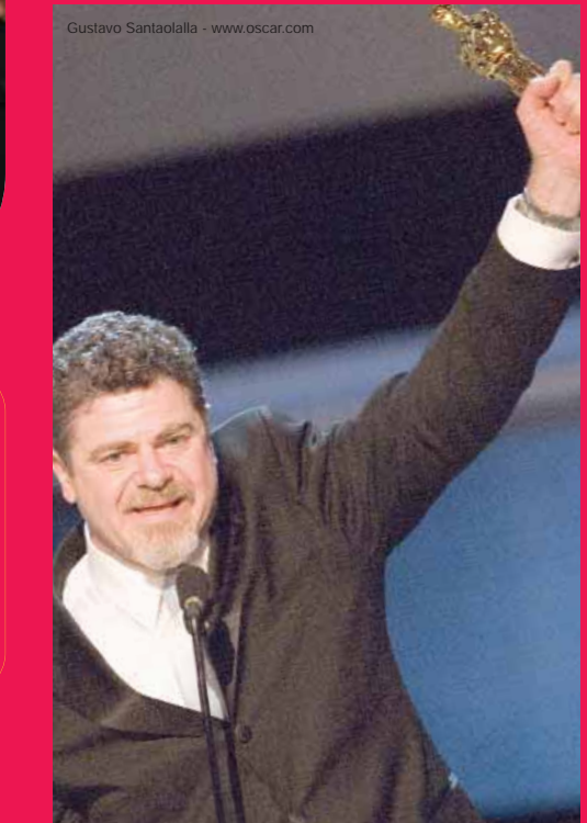
Gustavo Santaolalla

The World Soundtrack Academy has an excellent ear for new film composing talent. This is once again confirmed by this year's Oscars. The Argentinian composer Gustavo Santaolalla, World Soundtrack Discovery of the Year in 2004, won his first Oscar with the music for Ang Lee's Brokeback Mountain . Following his acclaimed soundtracks for Amores Perros , 21 Grams and The Motorcycle Diaries , he showed at last year's World Soundtrack Awards that he is also a gifted musician, when he gave the world première performance of the music from Brokeback Mountain . Another Oscar nominee, was the Spanish composer Alberto Iglesias, who had been nominated for his soundtrack for The Constant Gardener . He visited the Flanders International Film Festival two years ago when his music for Hable con Ella was performed.