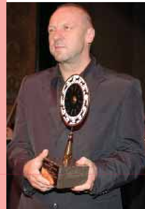
Zbigniew Preisner, favorite composer of Krzysztof Kieslowski, received a Joseph Plateau Lifetime Achievement Award