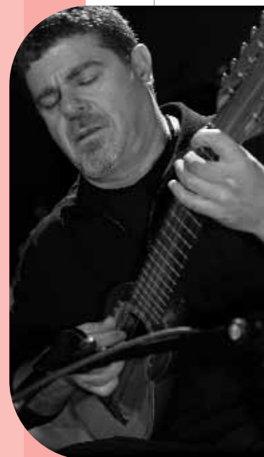
Gustavo Santaolalla, performed in world premiere his Oscar winning music of Ang Lee's Brokeback Mountain at the 2005 World Soundtrack Awards ceremony.

The same concert with music from the same composers was repeated in Ostend (Kursaal) on December 11 where French composer Maurice Jarre was present, since an important tribute was given to his lifetime work. Jarre even conducted his own music after which he got a standing ovation from the Belgian audience.